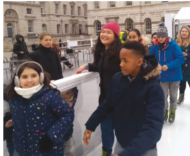
Participants enjoying free ice skating at Somerset House.