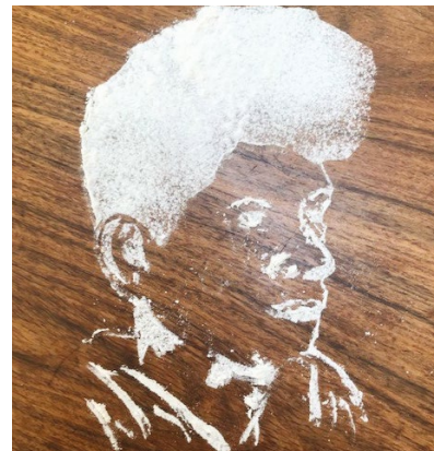
Submissions to our creative challenges.