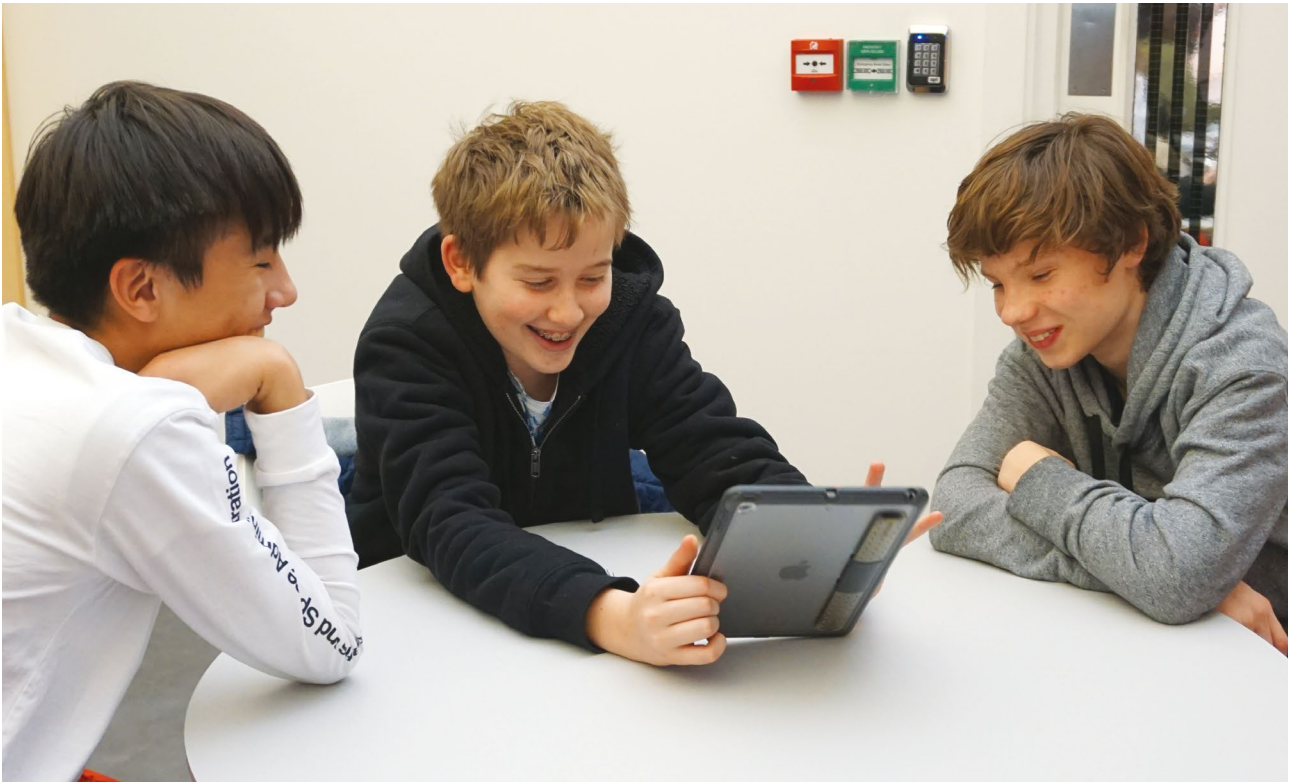
Participants at a vlogging workshop with Three.

of participants strongly agree or agree that now they are able to communicate better with others