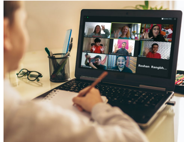
The youth troupe from Rangbhumti Applied Theatre, India, performed an interactive play for our City Lions.

Keen to get involved with our virtual youth club? Email citylions@westminster.gov.uk